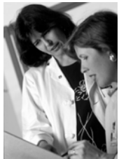
UVA Dietetic Internship focuses on Medical Nutrition Therapy

The internship program, which has an emphasis in nutrition therapy, provides dietetic interns with over 1500 hours of supervised practice experience and training in clinical, administrative, and community dietetics. Clinical and administrative on-the-job training is provided at the University of Virginia Health System and at other affiliated locations. The internship provides the individual intern with the resources necessary for education and training to qualify the intern for responsibilities as an "entry level" generalist dietitian but with additional specialization in medi-