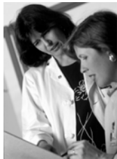
UVA Dietetic Internship focuses on Medical Nutrition Therapy

The internship program, which has an emphasis in nutrition therapy, provides dietetic interns with over 1500 hours of supervised practice experience and training in clinical, administrative, and community dietetics. Clinical and administrative on-the-job training is provided at the University of Virginia Health System and at other affiliated locations. The internship provides the individual intern with the resources necessary for education and training to qualify the intern for responsibilities as an "entry level" generalist dietitian but with additional specialization in medi-