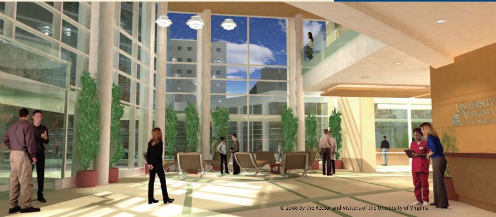
Artist's conception of lobby